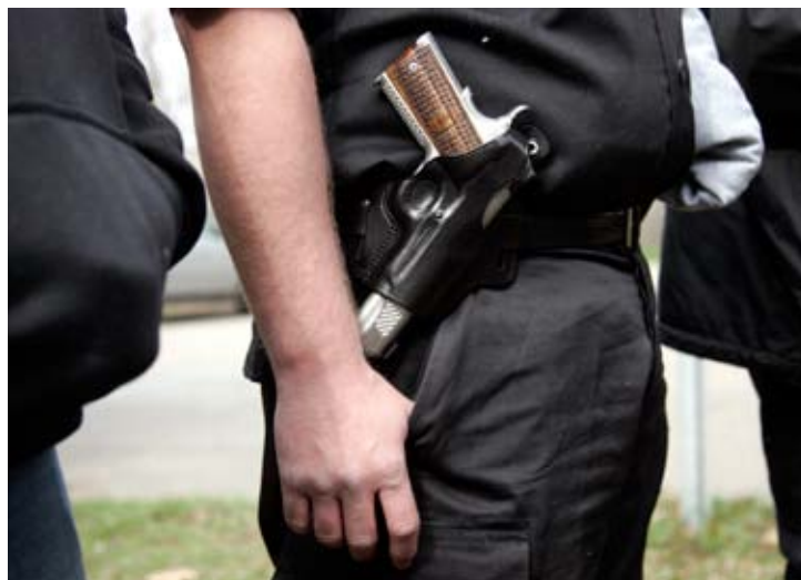
A man openly wears his gun during the Michigan Volunteer Militia “open carry” family day picnic at a state park in Brighton, Michigan April 10, 2010.

“I can’t see this (tension between federal authorities and the people) ending in any other way other than conflict,” he said in an interview. “They (the government) truly believe that when they issue an order they think it will be obeyed. I don’t see how that can end other than civil war.”