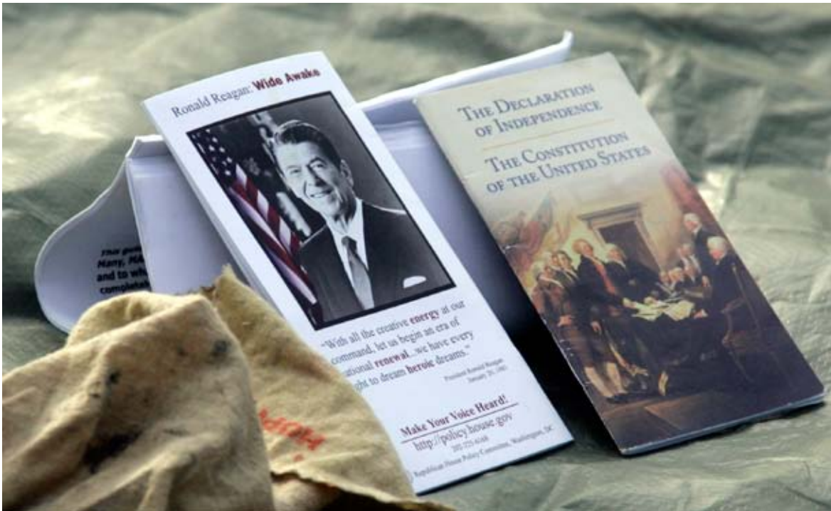
Two small booklets, one on the U.S. Constitution and the other with a picture of former U.S. President Ronald Reagan on the cover, sit next to weapons belonging to a Michigan Volunteer Militia member during a militia "survival in the wilderness" training event at a state park in Brighton, Michigan in this photo taken April 3, 2010.

"Many militia members and other extremists believe that the recently passed health care legislation will be followed by the mass legalization of illegal immigrants, postponement or elimination of democratic elections, martial law and gun confiscation," it said.