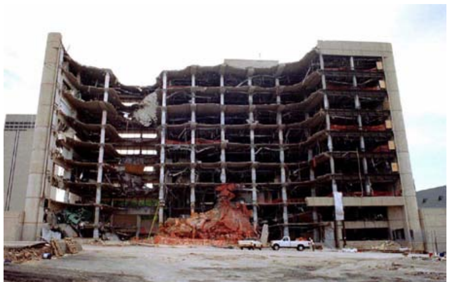
The Alfred P. Murrah Federal Building stands ready for implosion in Oklahoma City in this May 22, 1995 file photo. This view is from what used to be a parking lot north of the building. Oklahoma City bomber Timothy McVeigh was executed in 2001 for a crime that took 168 lives.

The Anti-Defamation League, which monitors militia websites, said anti-government extremists were widely citing healthcare reform as a justification for violence.