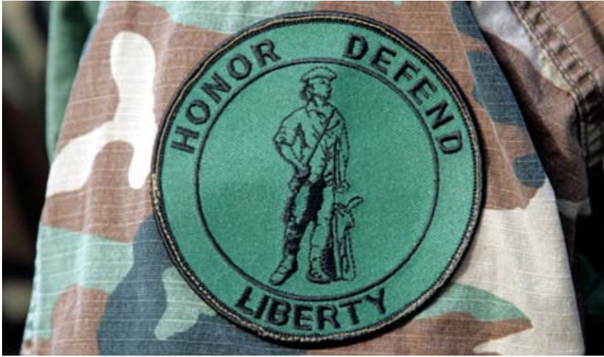
An arm patch is seen on the shoulder of a Southeast Michigan Volunteer Militia member during a militia "survival in the wilderness" training event at a state park in Brighton, Michigan April 3, 2010.