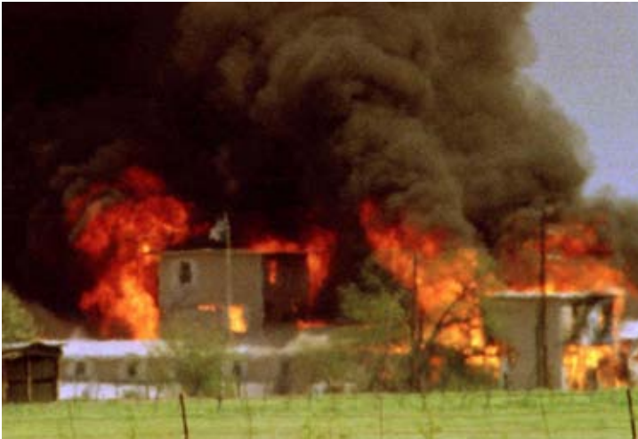
The Davidians' Mount Carmel compound near Waco, Texas, is shown engulfed in flames in this April 19, 1993 file photo.