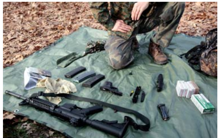
A Southeast Michigan Volunteer Militia member prepares to take part in a weapons exercise during a militia "survival in the wilderness" training event at a state park in Brighton, Michigan in this photo taken April 3, 2010.